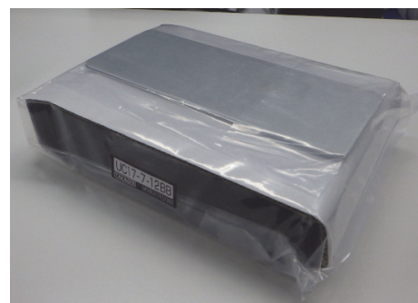
Larger Models (with plain cardboard)