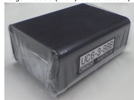
Smaller Models (without cardboard)